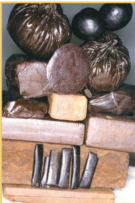
Several kinds of hash, including Nepalese Temple Balls, Blonde Lebanese, and Afghani slabs.