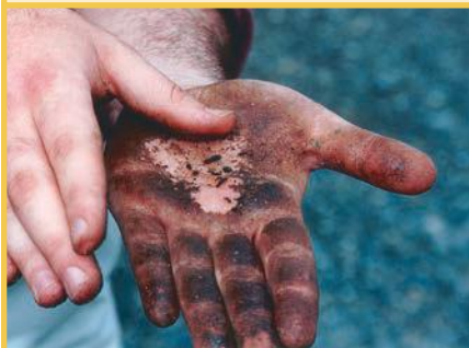
Rubbing hand hash to create a ball.