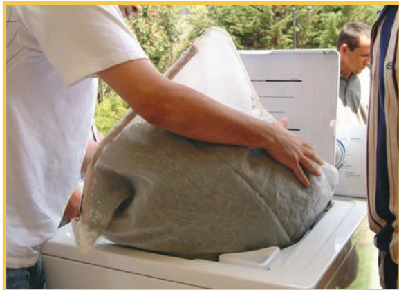
Converted cold-water washing machine being loaded with trim to make hash.

Advanced water hash uses the same principles outlined in the Water Hash chapter, it just takes into account more variables, from the strain type and trichome shape to harvest methods and ambient temperature and humidity in the washing room.