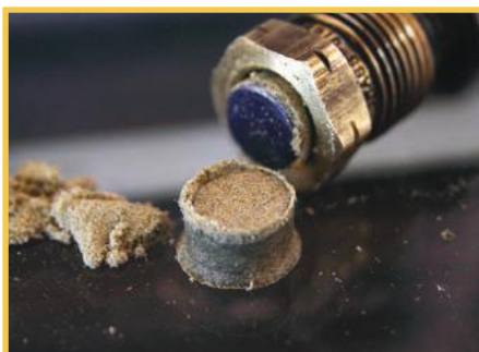
Mechanically pressed hash.

Pressing hash involves a combination of force and mild heat to condense the glands into a solid mass. The shape and size of hash varies depending on the pressing method. When hand pressed, hash is often ball-shaped. Flat-pressed hash may look like thin shale rock, with hardened shelf-like layers that chip along the creases. Mechanically pressed hash is usually a neat cake, like a bar of soap. Hashish ranges in color and pliability. The variety of marijuana used, manufacturing method, temperature, and the purity of the kief influence