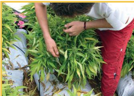
Collecting hash resin.

Kief and water hash methods of collection are covered thoroughly in chapters 2 and 3. While these two processes have different advantages, each yields dry, loose material that can be pressed to make hash. Before attempting to press kief or water hash, the material must be completely dry. To ensure that all moisture has been eliminated before pressing, dry the material one last time. Place the kief or water hash in a food dehydrator set on the lowest setting, a horticultural heat mat (preset at 74°F [23°C]), microwave the material on low, or place it in an open dish in a frost-free freezer. The vacuum conditions promote water evaporation, preventing mold from infecting and spoiling the hash. However, when the drying temperature is above 75°F (24°C) some of the terpenes will evaporate, costing the hash a panoply of unique odors and their effects.