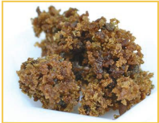
Full melt bubble hash.

Aficionados often describe the high that hash produces as more complex than that of kief. In the region of traditional hash making, kief is typically aged, sometimes for a year or more, before it is pressed. Most modern hash makers do not wait that long.