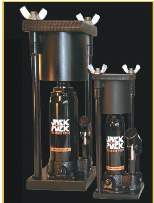
This heavy-duty unit presses large amounts of kief.

Hand-pumped hydraulic presses are a less expensive way to get a tight press. Another cost-effective method uses a vice grip, although it takes some adaptation. For small amounts, a pollen press can be used in conjunction with a handheld kief-collecting grinder. Kief is added to this small metal tube. The tension pin is placed in, and the pollen press is screwed shut. The next day, the kief has been pressed into a neat hash block. Many companies have similar presses now, including one made of stainless steel with a low-torque T-handle.