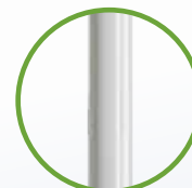
Robust structure Ø16mm Q195 Steel