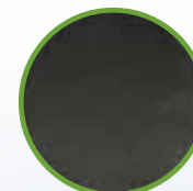
Reinforced bottom PE600 Oxford