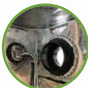
Optimized vents Cable and Ducting flanges

The Dark Street IV è la nostra gamma dedicata per spazi limitati da 0,36 a 1,44 metri quadrati. Costruito con materiali di alta qualità, porta standard professionali agli utenti di piccole tende. Pronto all'uso, puoi installare facilmente la tua Dark Street con tutti gli accessori inclusi.