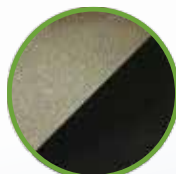
Reflective Mylar 210D