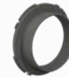
Connectors 100 - 125 - 150 mm