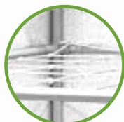
Ready to use Space booster, WebIT & more